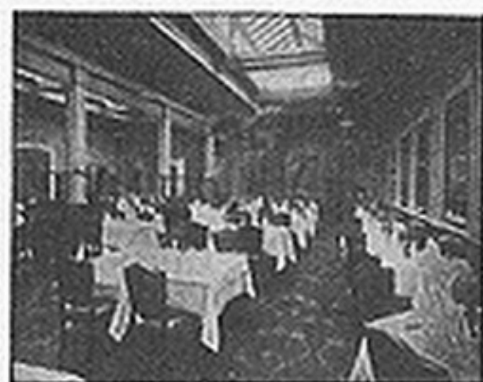
TABLE D'HOTE DINNER from 5/- And Dancing every Saturday until 12.

Individual attention to clients assured. Cuisine and Cellar of well-known reputation.